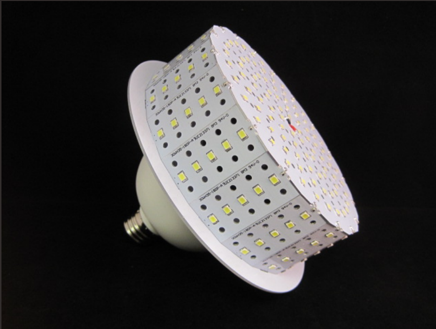
AMATRON 30W LED GARAGE LAMP WITH E26 BASE

AMATRON 30W LED Garage Lamps lower energy costs by at least 75% compared to conventional high intensity lighting. Our bulbs burn very brightly and disperse light over a 360 degree range.